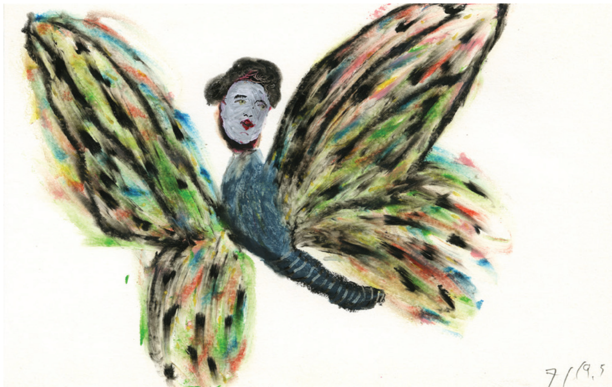
diary drawing 7/19.5 (2014), mixed media on paper, 148x210 mm