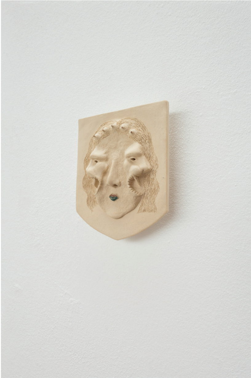
from Wapenschilden (2020), glazed ceramic, 12x15x1 cm