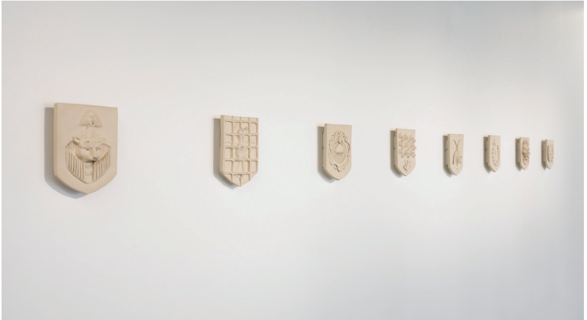
Wapenschilden (2020), glazed ceramics, group of 20 works Installation view at solo Clara Sekirara (2022), Contemporary Art Foundation, Tokyo, Photo: Keizo Kioku