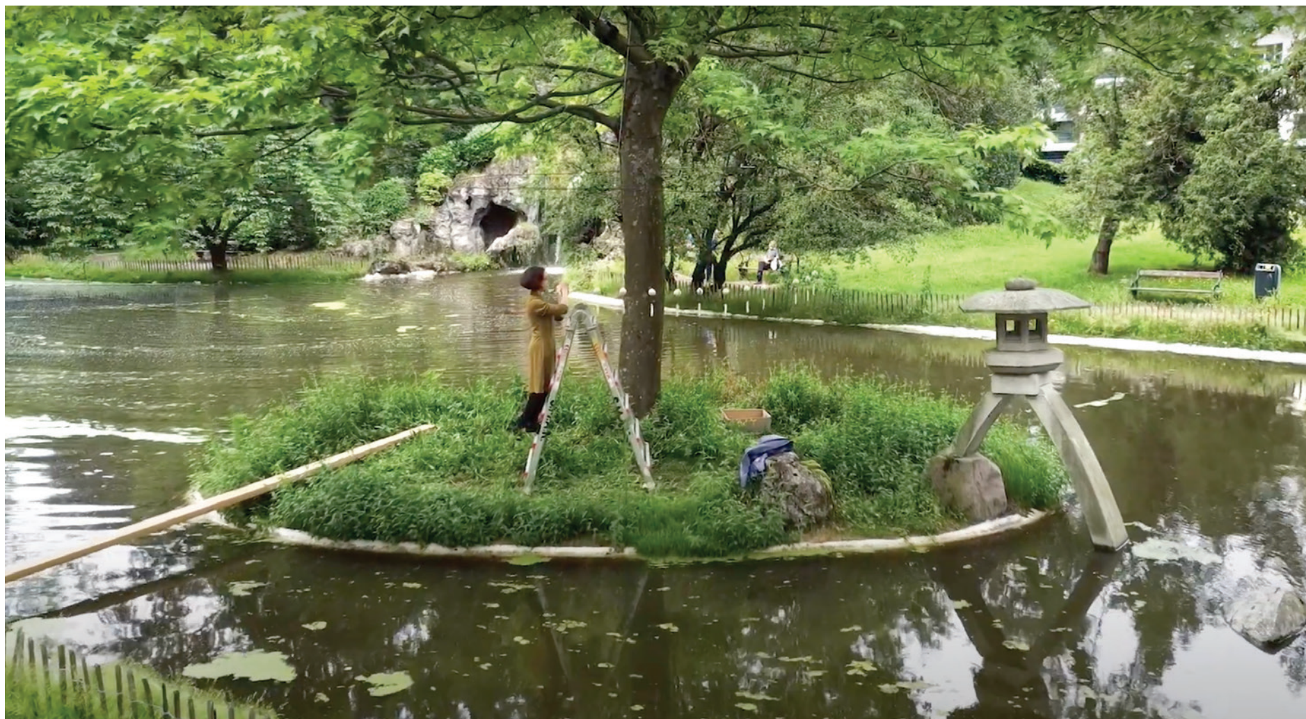
Happy 50th Anniversary (2021), porcelain sound installation, 4 x 4 m Publiek Park, Vrienden v/h S.M.A.K., Citadelpark Gent