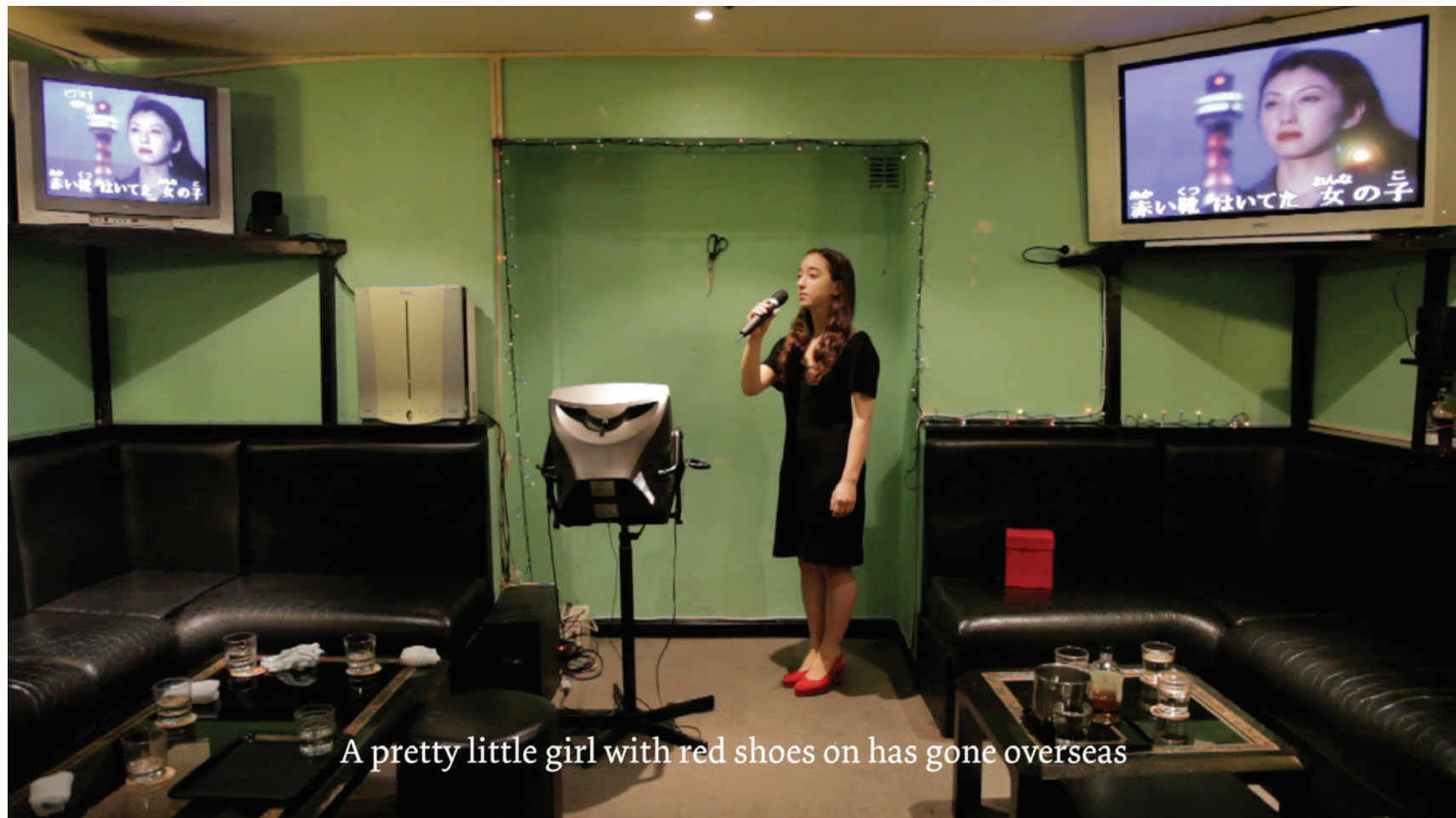
A still from Hotel Red Shoes (2013), 15"02'