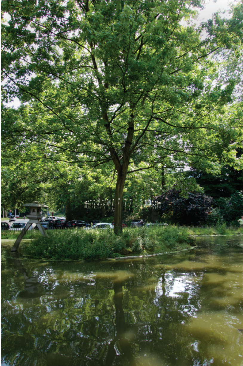
Happy 50th Anniversary (2021) , porcelain sound installation, 4 x 4 m Publiek Park, Vrienden v/h S.M.A.K., Citadelpark Gent