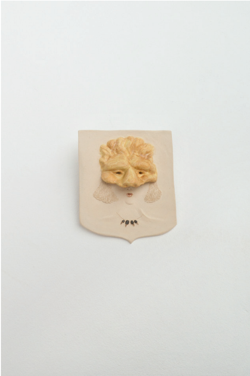
from Wapenschilden (2020), glazed ceramic, 7x9x0.5 cm