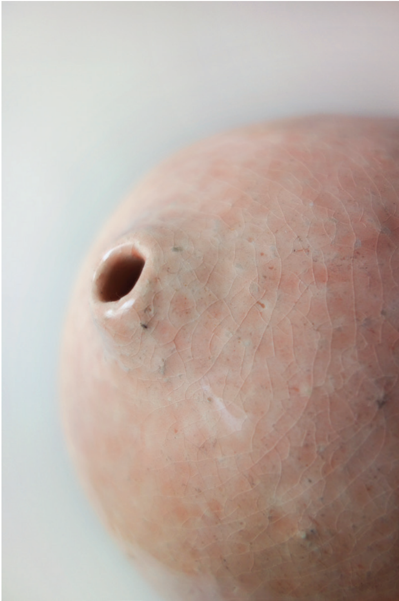
from the series Fertile Vases (2020, detail), glazed ceramic, 50x35x10 cm