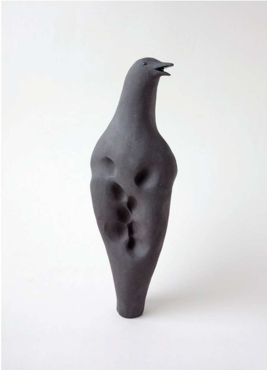
Wedding Dove (2021), glazed ceramics, 22x5x8 cm