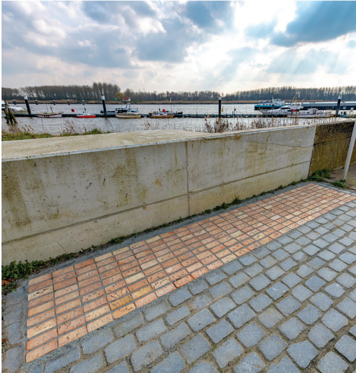
1000 bakstenen (2022-23), walking path, Mercatoreiland