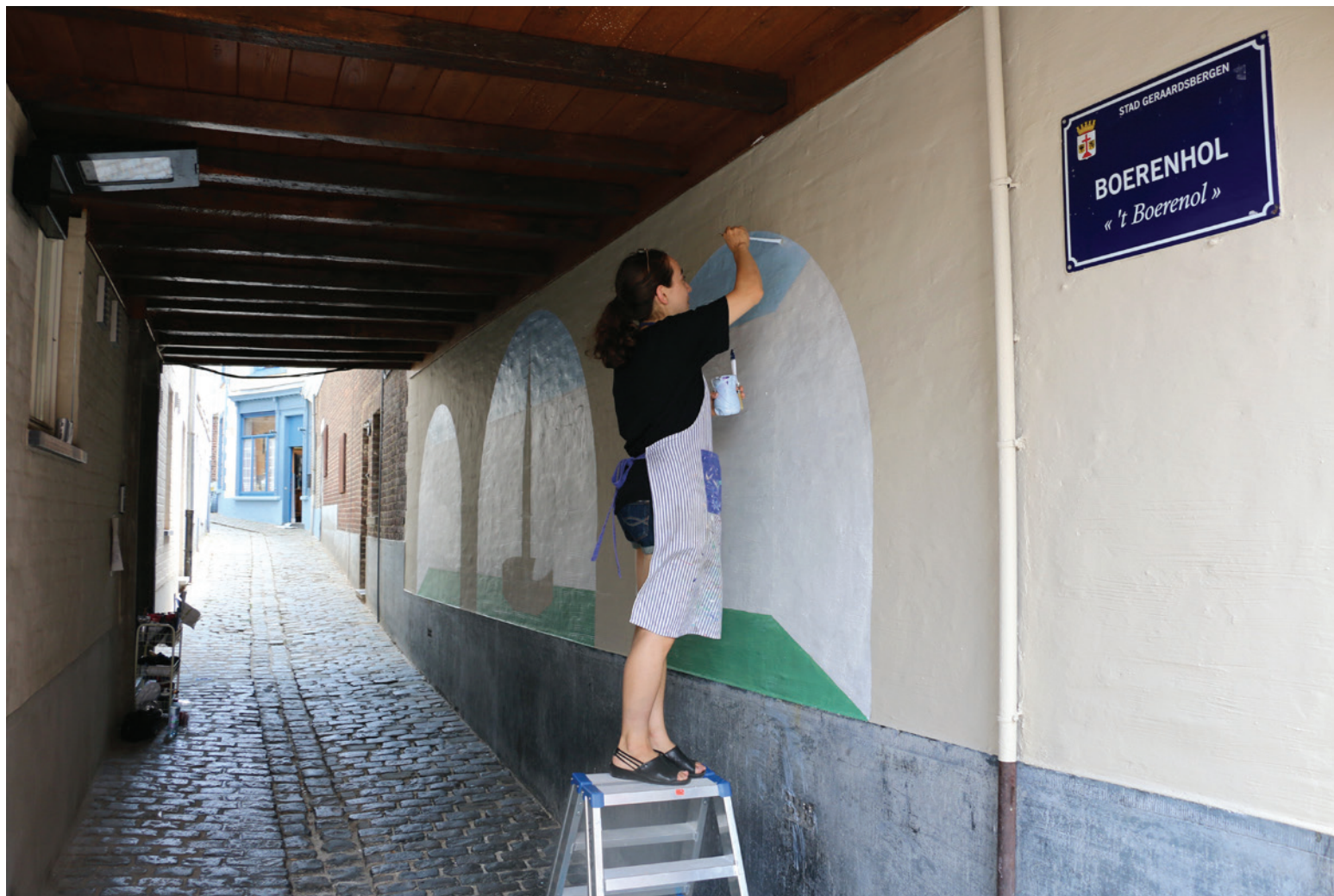
Making of Verboden Paradijs (2018), acrylic paint, 2x8m, Geraardsbergen