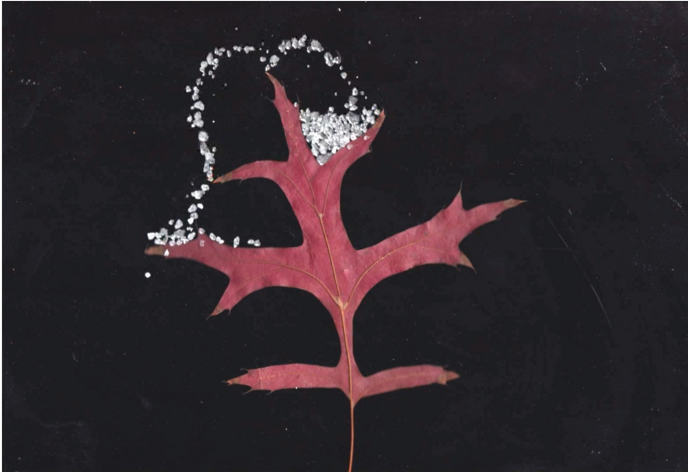
A still from De Zeven Natuurwonderen (2019), 03''19'