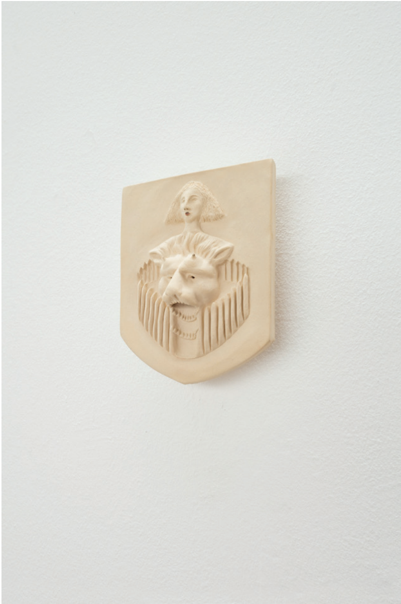
from Wapenschilden (2020), glazed ceramic, 12x15x1 cm