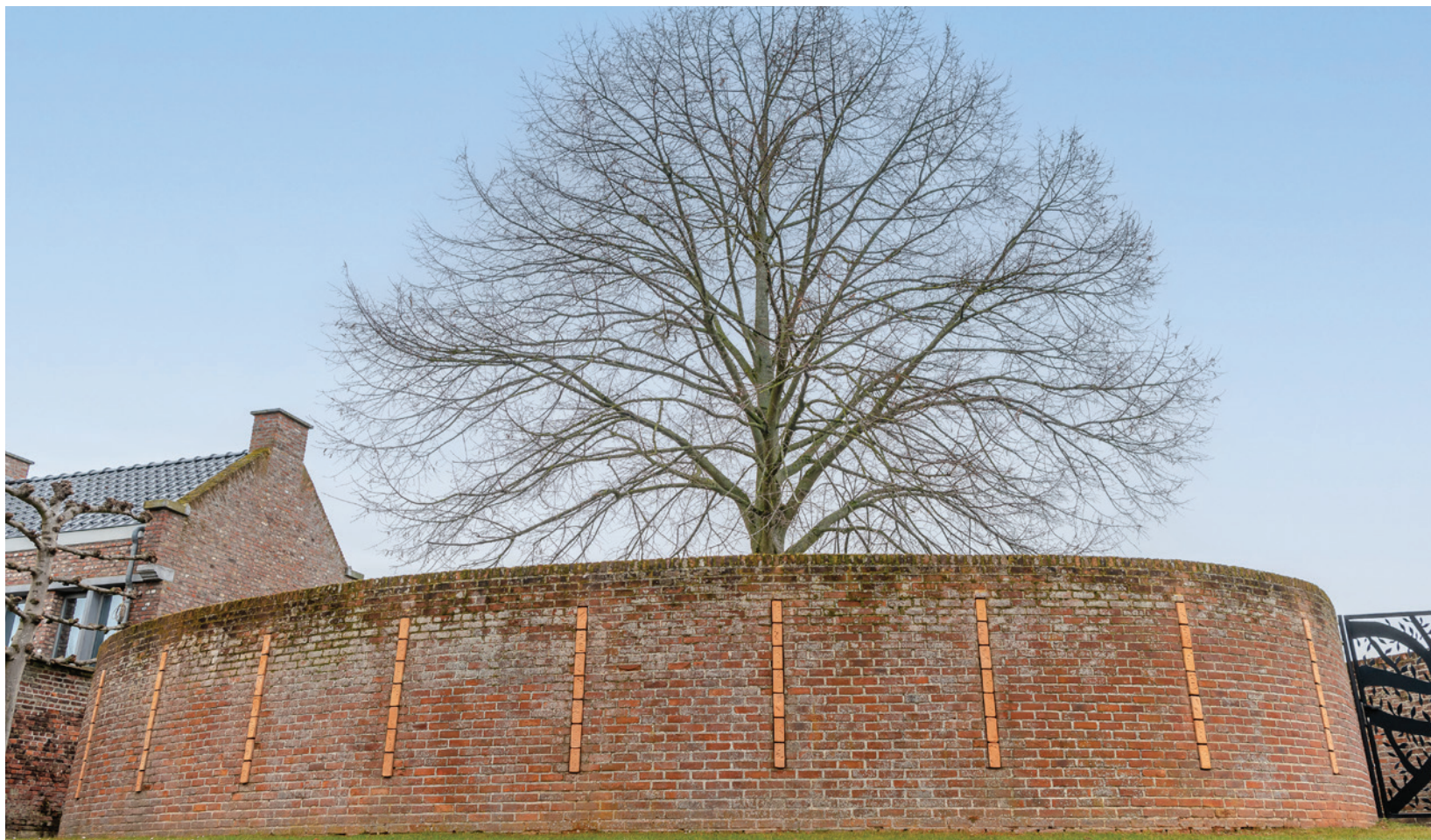
1000 bakstenen (2022-23), wall sculpture, Kerkhof Rupelmonde