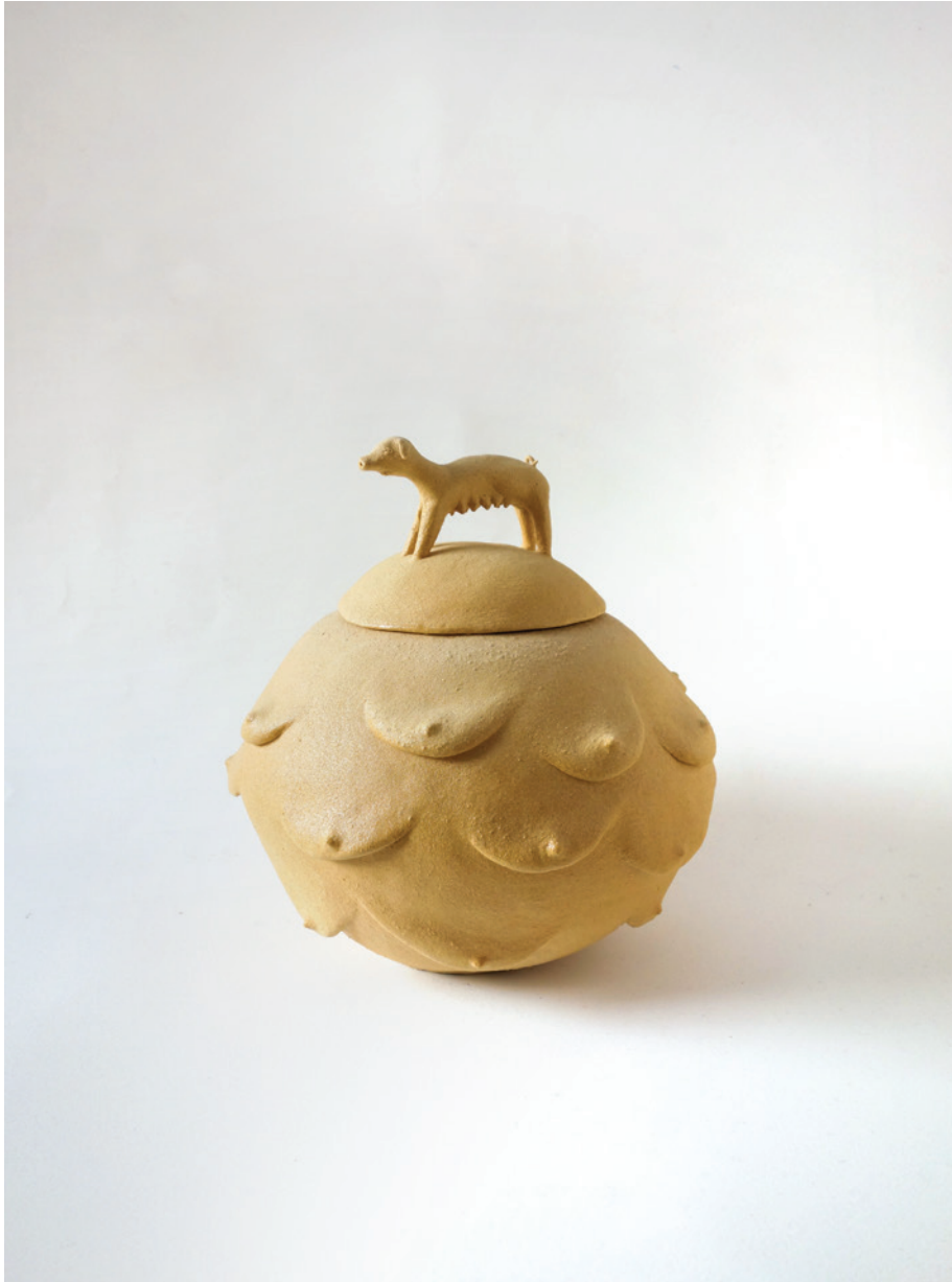
from the series Fertile Vases (2020), glazed ceramic, 25x25x30 cm