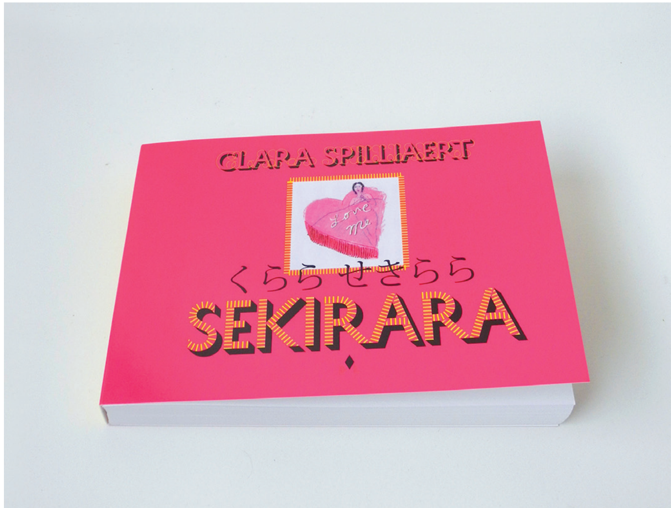
Publication SEKIRARA (2022) MER. Studio Luc Derycke / Borgerhoff & Lamberigts