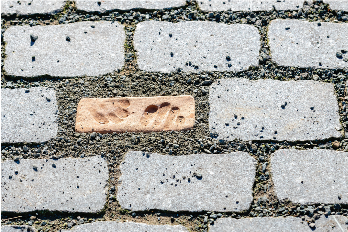
1000 bakstenen (2022-23), walking path, Mercatoreiland