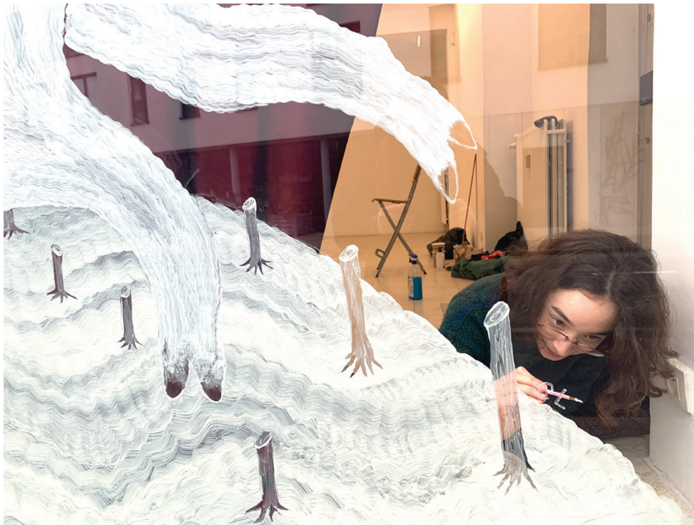
Window painting with porcelain-slib (2022) at LLS Paleis, Antwerp On the occasion of book launch "SEKIRARA"