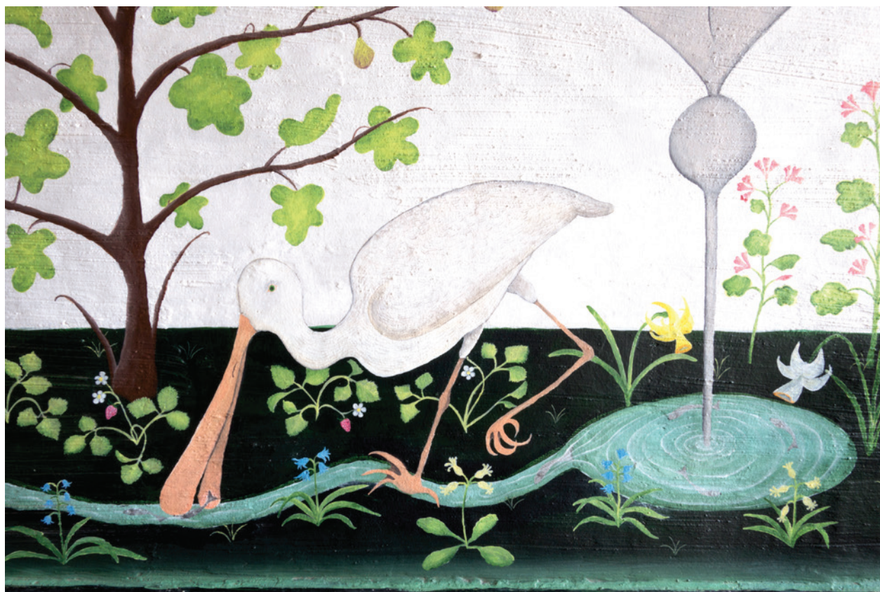
Verboden Paradijs (2018, detail), acrylic paint, 2x8m, Geraardsbergen