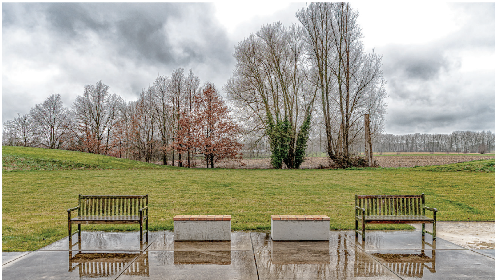
1000 bakstenen (2022-23), 2 benches, WZC Poldervliet