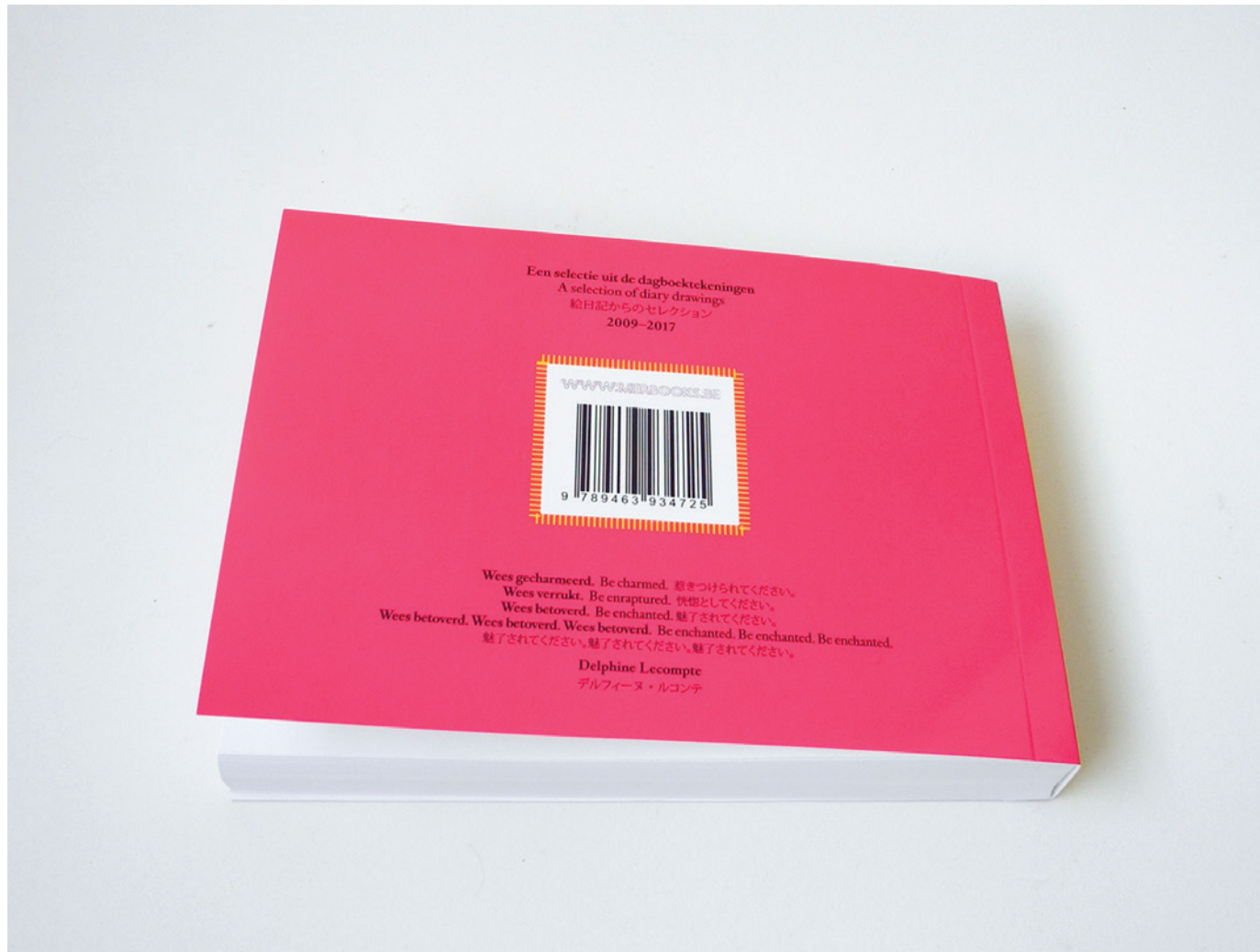
Publication SEKIRARA (2022) MER.