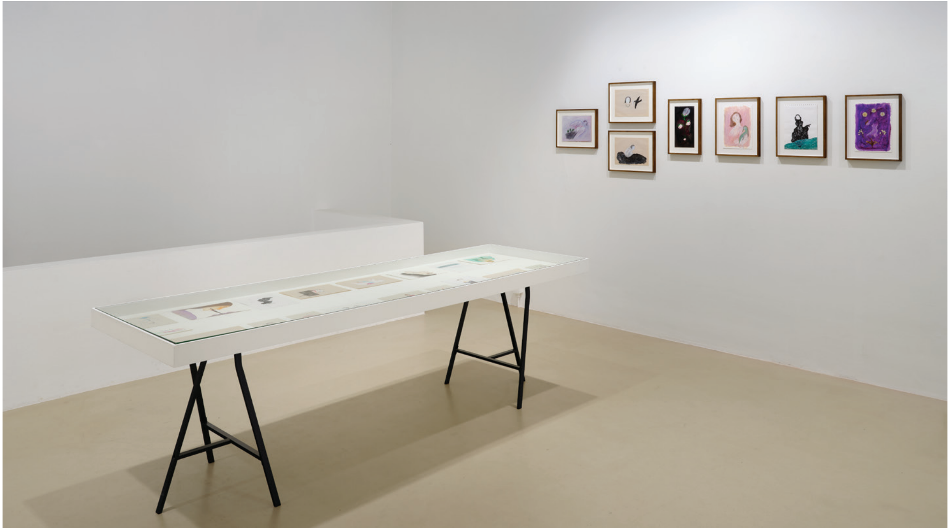
Installation view at Paper Cuts (2023), Keteleer Gallery, Antwerp