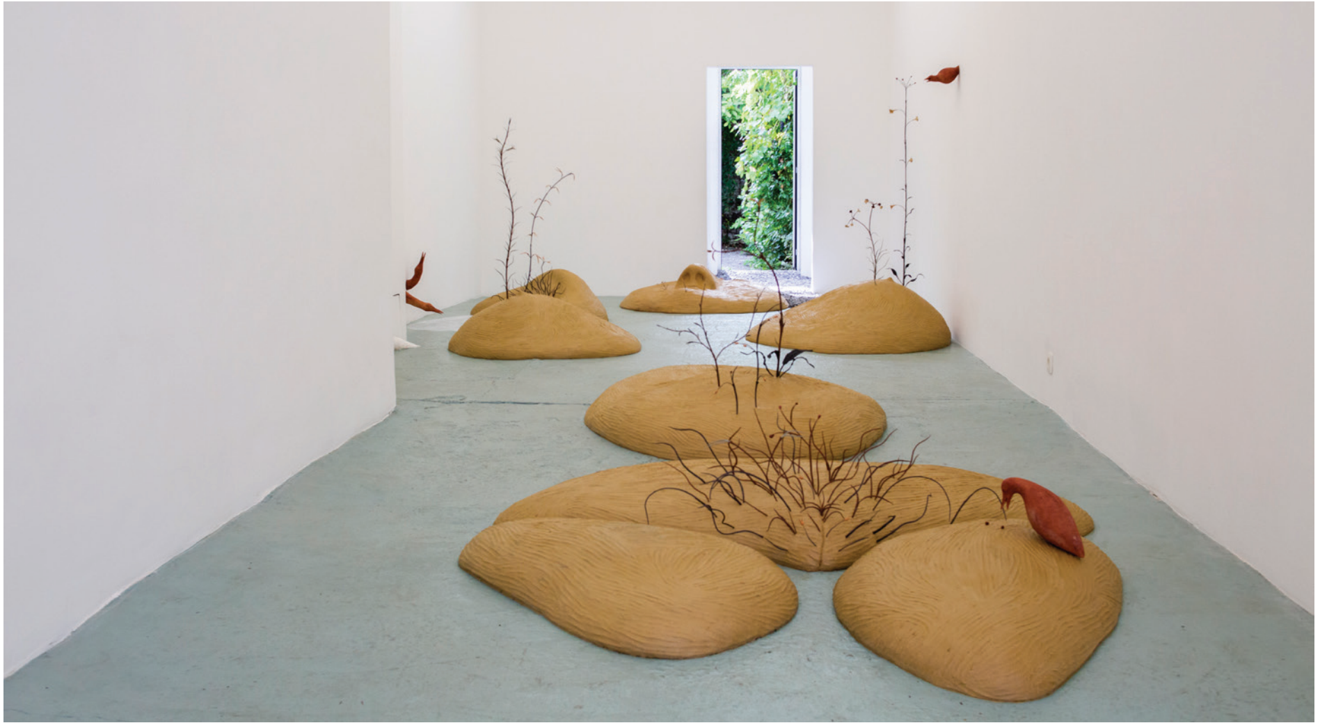
Hairy Tale (2023) Installation at Lichtekooi Artspace