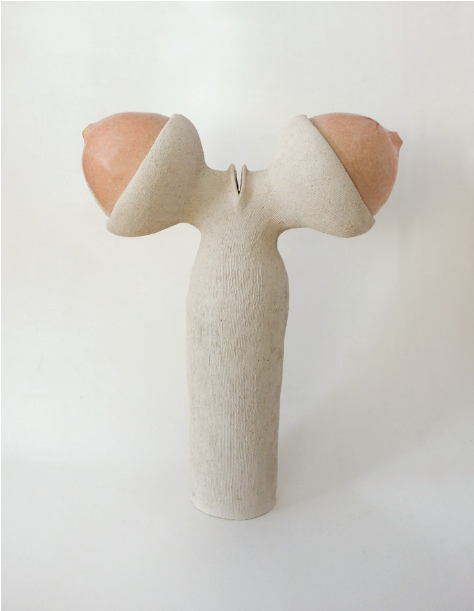
from the series Fertile Vases (2020), glazed ceramic, 50x35x10 cm