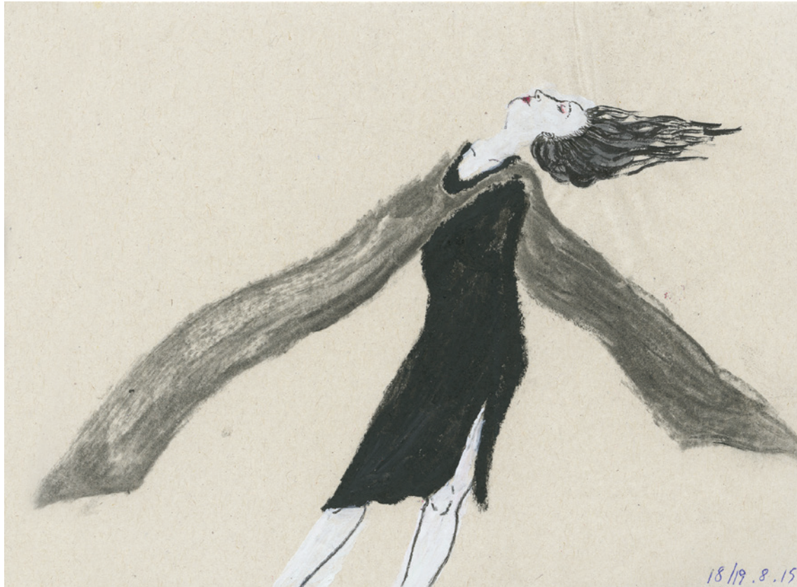
diary drawing 18/19.8.15 (2015), mixed media on paper, 148x210 mm