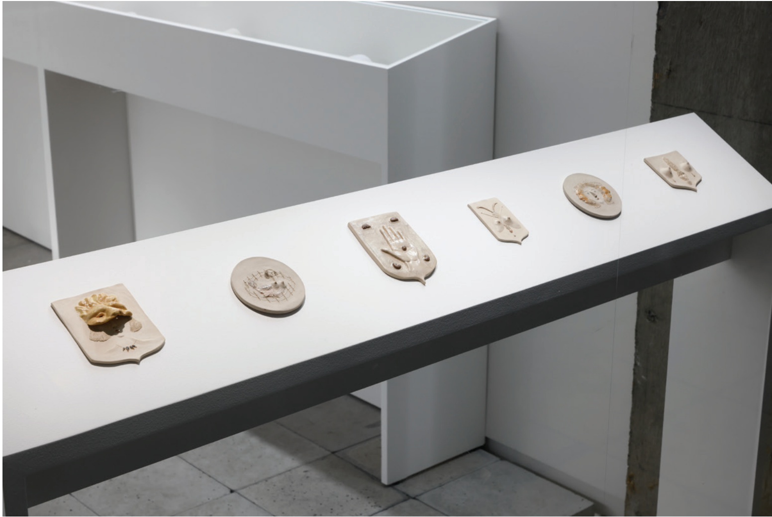
Wapenschilden (2020), glazed ceramics, group of 20 works Installation view at solo Clara Sekirara (2022), Contemporary Art Foundation, Tokyo, Photo: Keizo Kioku