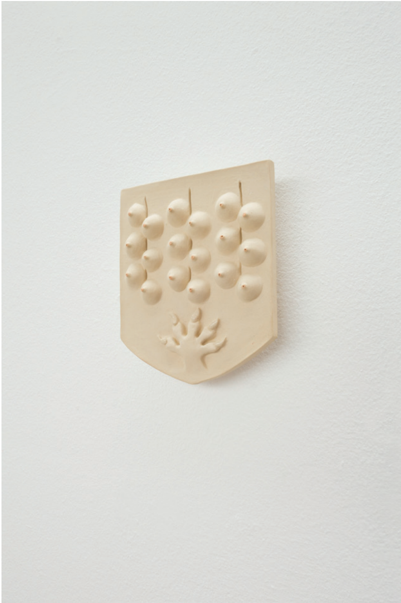
from Wapenschilden (2020), glazed ceramic, 12x15x1 cm