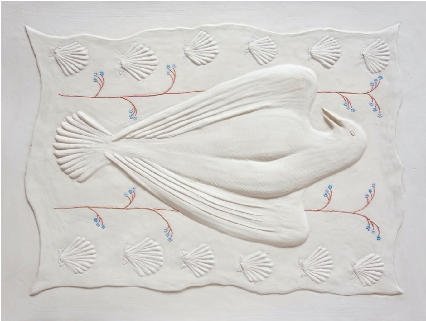
Antwerp Requiem (2022), plaster with watercolor, 24,5x31x2 cm