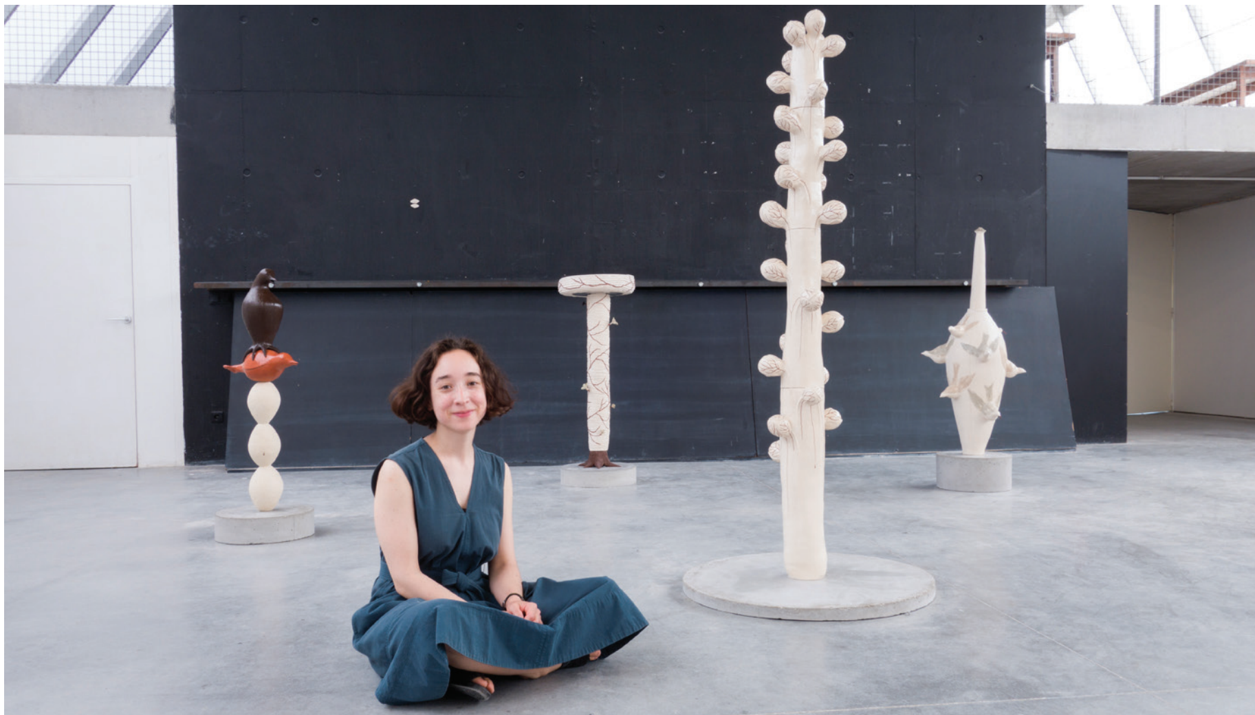
Installation view of Stambomen (2021), LUCA School of Arts, Gent