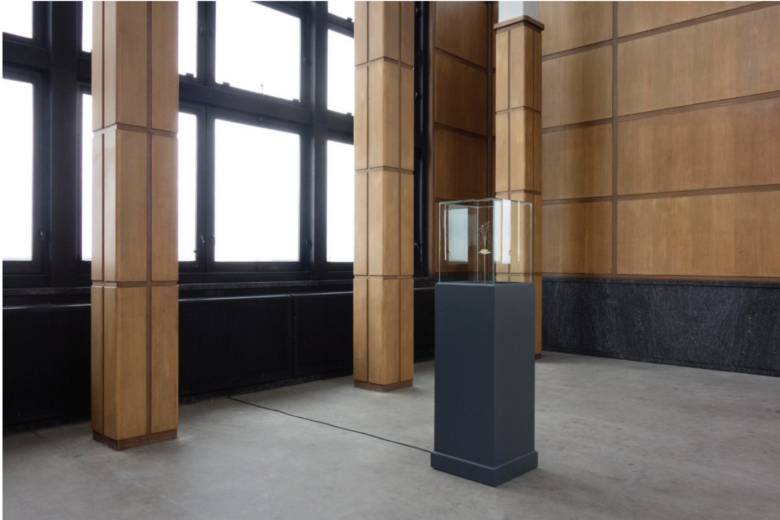
Self-portrait (2015), mixed media, 45x45x190 cm Installation view at Belvédère Boekentoren (2015), Gent