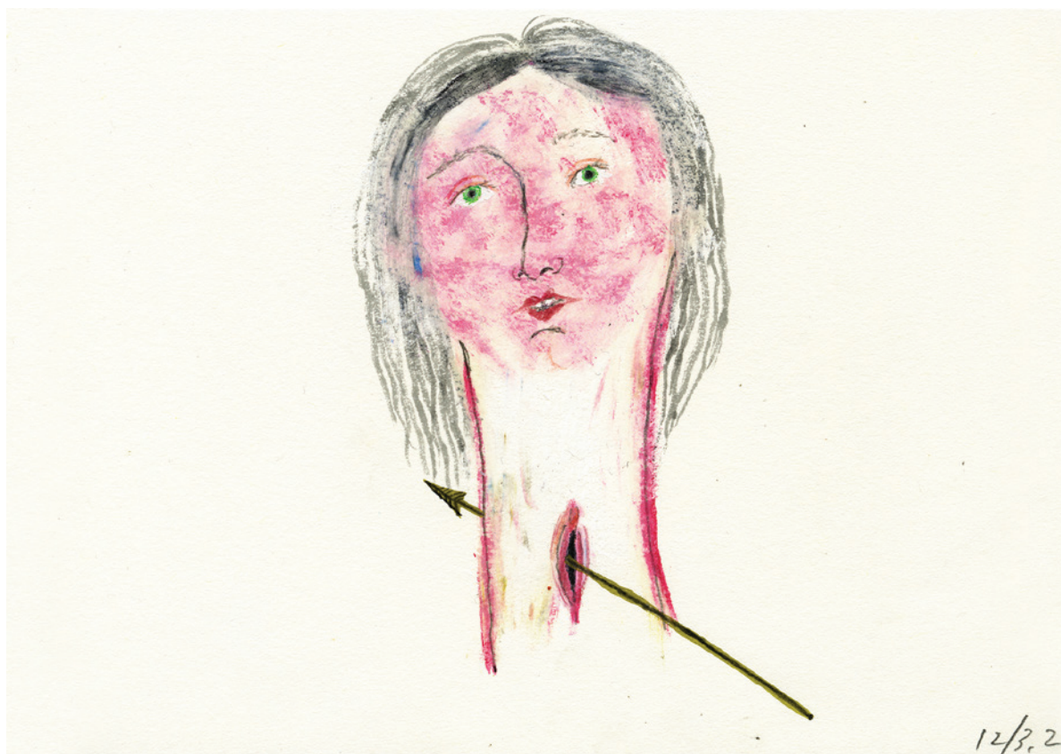
diary drawing 12/3.2 (2015), mixed media on paper, 148x210 mm