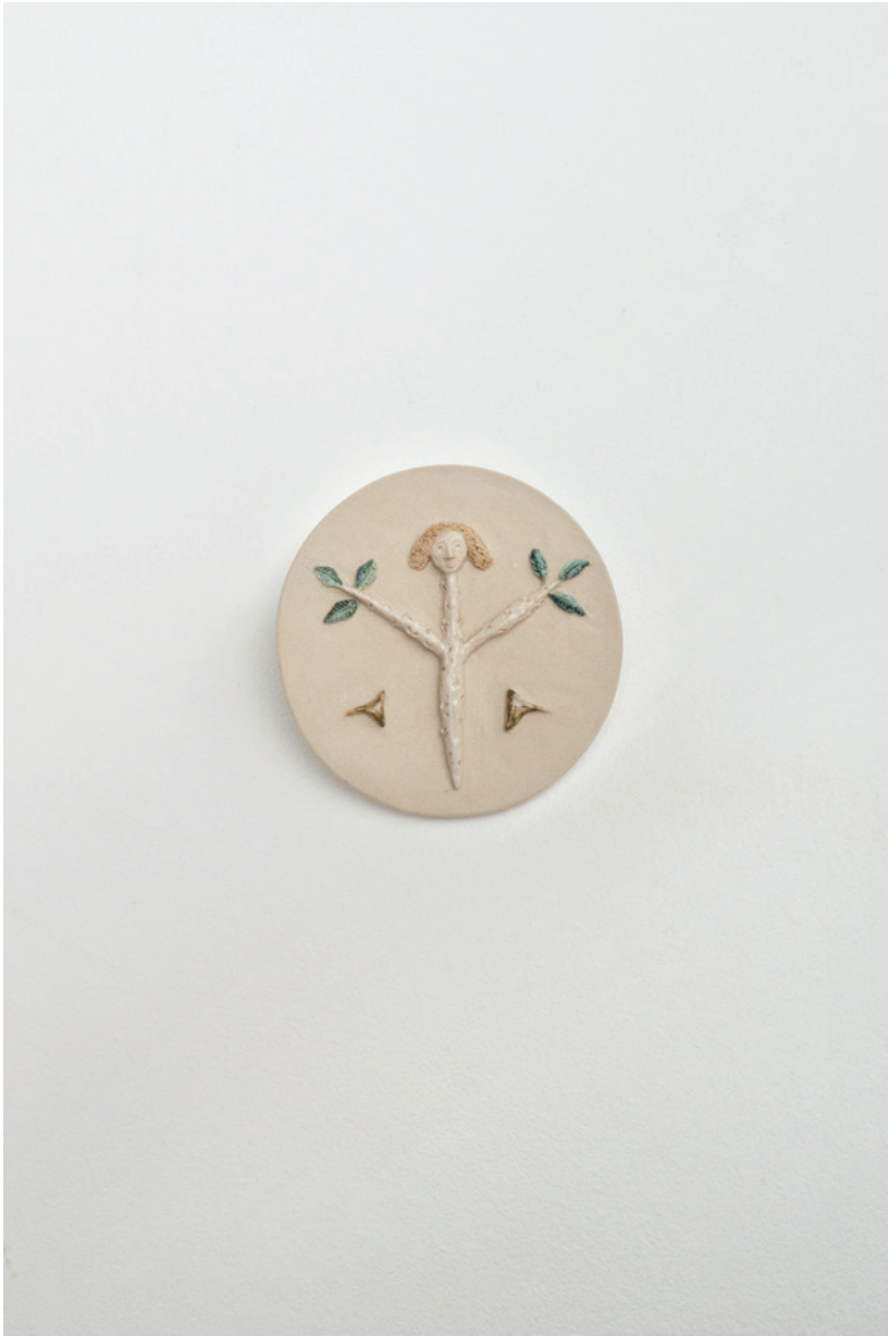
from Wapenschilden (2020), glazed ceramic, 10x10x0.5 cm