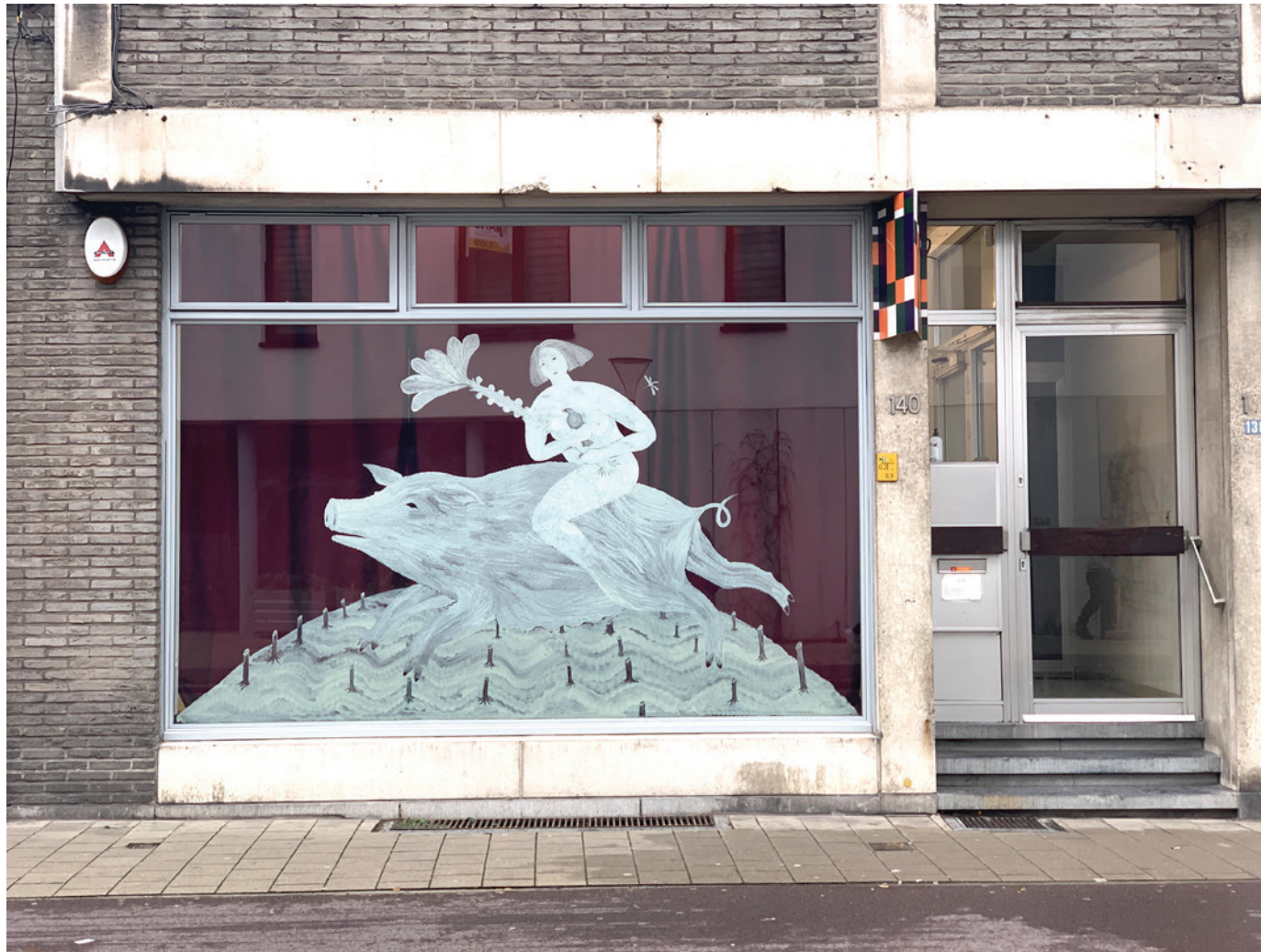
Window painting with porcelain-slib (2022) at LLS Paleis, Antwerp On the occasion of book launch "SEKIRARA"