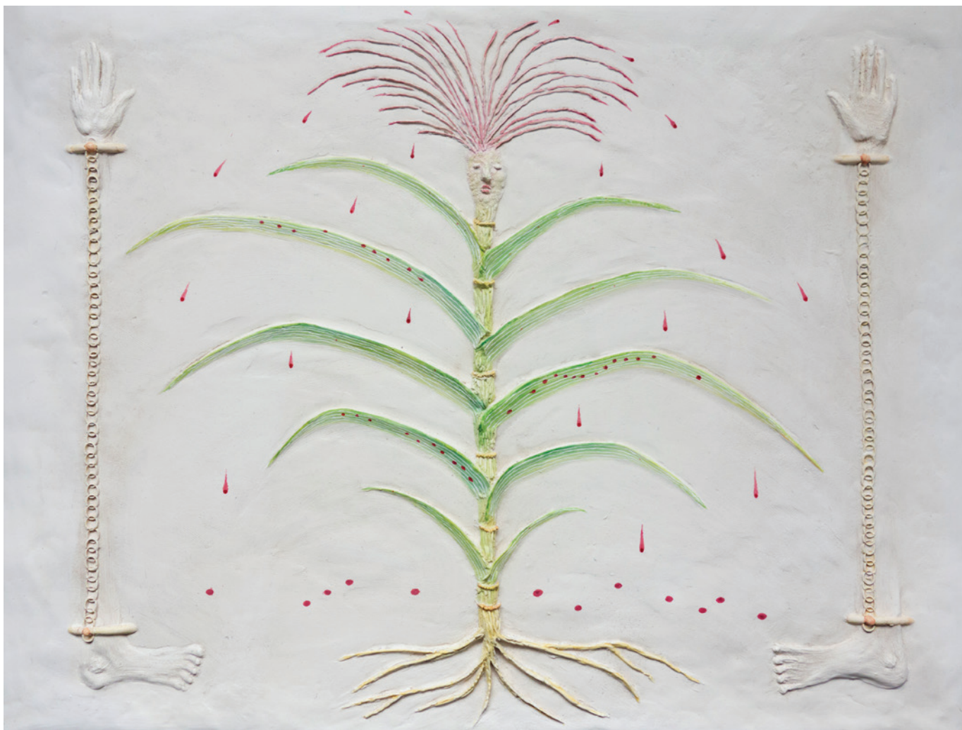
Adventurers (2022), plaster with watercolor, 24,5x31x2 cm