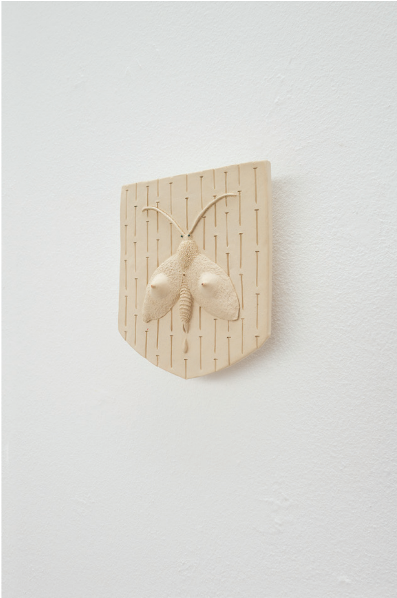
from Wapenschilden (2020), glazed ceramic, 12x15x1 cm