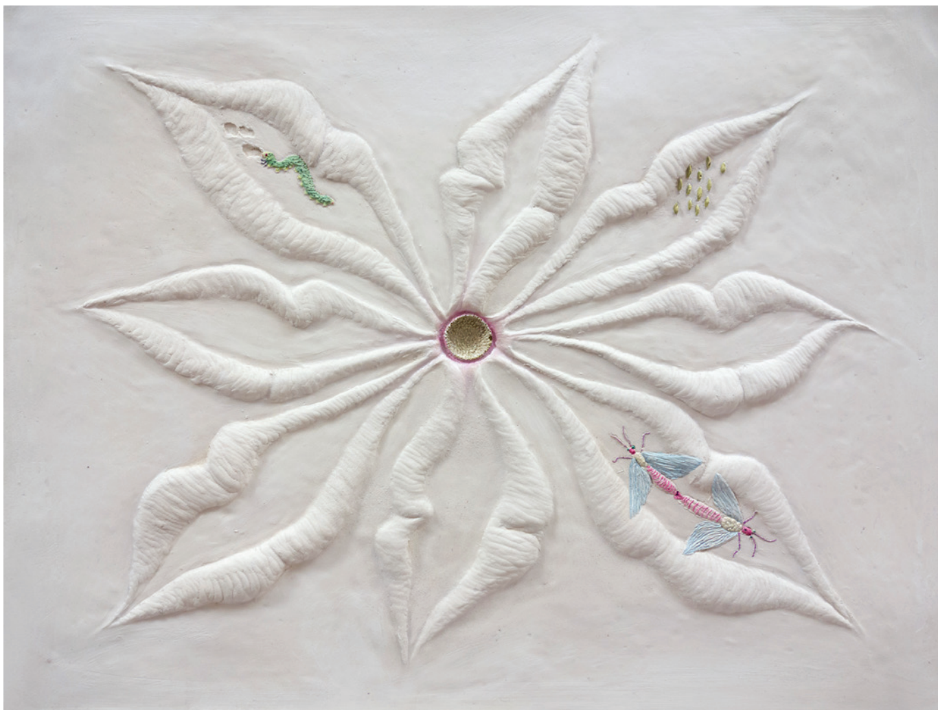
Madrigals (2022), plaster with watercolor, 24,5x31x2 cm